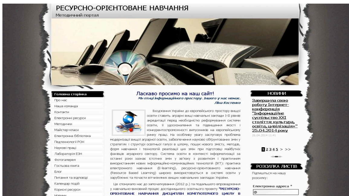
Figure: 5 A site is the Resource-based learning: methodical portal

Familiarizing with electronic educational resources is possible on a site the Resource-based learning: methodical portal of http://rbl3.webnode.com.ua (Figure: 5).