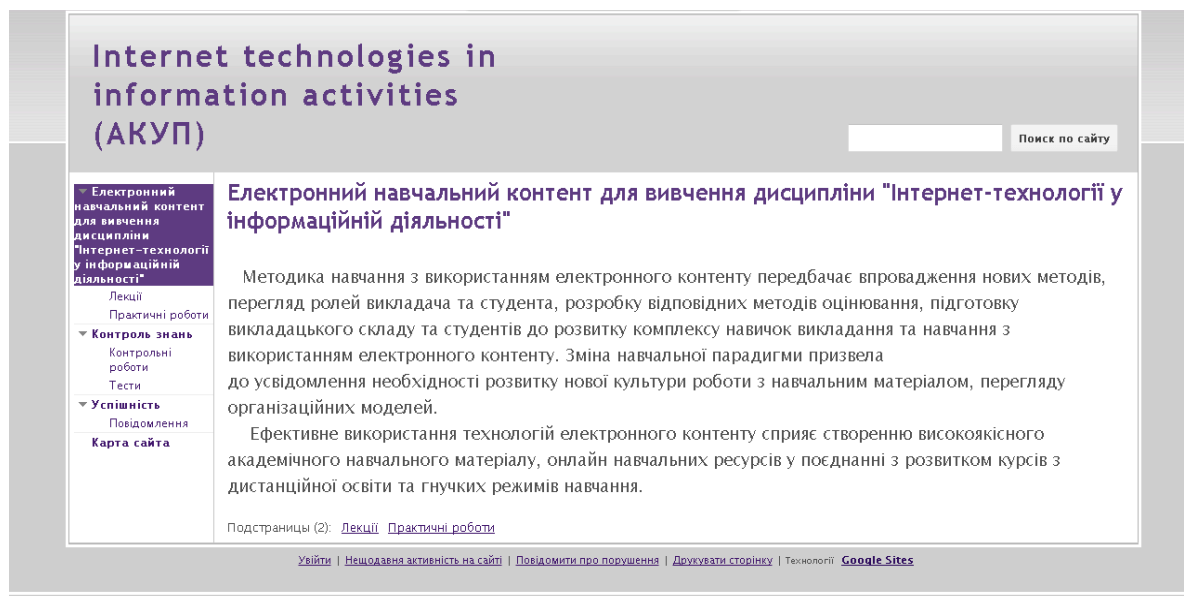
Figure: 4 A site of study of course of "Internet technology is in informative activity"

Familiarizing with electronic educational resources is possible on a site the Resource-based learning: methodical portal of http://rbl3.webnode.com.ua (Figure: 5).